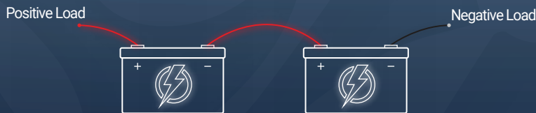
Series Connection 24V 75Ah Bank Increases Voltage, Ah stays the same.