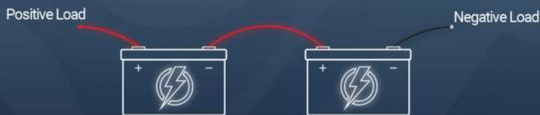
Series Connection 48V 100Ah Bank Increases Voltage, Ah stays the same.