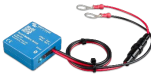
Bluetooth sensing Smart Battery Sense