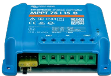
SmartSolar Charge Controller MPPT 75/15