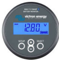
Bluetooth sensing BMW-712 Smart Battery Monitor